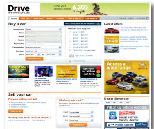
Drive.com.au December 2011 Exclusive UBs - Australia