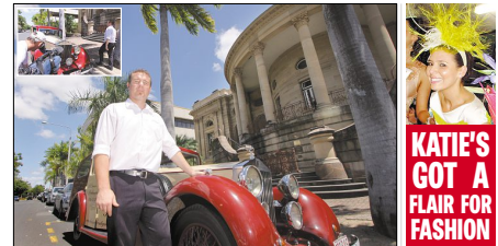
Matt's hotel delivers Rolls Royce treatment

WEEK 10000: The Morning Bulletin has been named the 1000th Best Paper in the Australian Business Review, and when it stars in an upcoming television show. See story on Page 6.